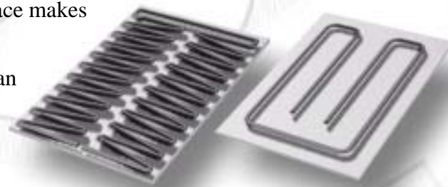
Digital Knight SuperCoil-Microwinding™ heat platen